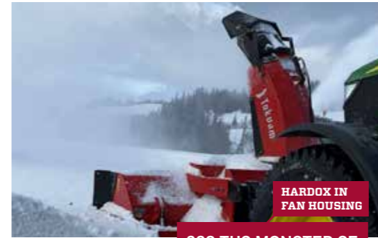
HARDOX IN FAN HOUSING 260 THS MONSTER SE