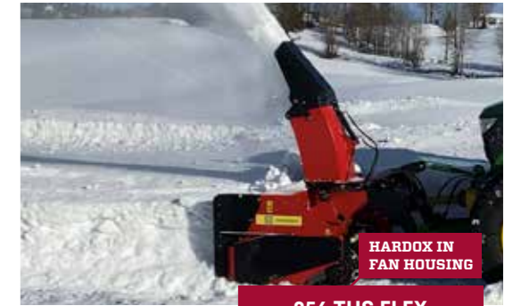
HARDOX IN FAN HOUSING 256 THS FLEX

The 260THS Monster SE is a high capacity, thoroughly tested two-stage blower for tractors with up to 300 HP. This powerful snow-blower is the perfect snow-blower for opening up roads and loading snow onto trucks. It can also be rear mounted for continual snow removal. The 260THS Monster SE is available with a vast array of accessories, allowing us to provide you with a customized snow-blower.