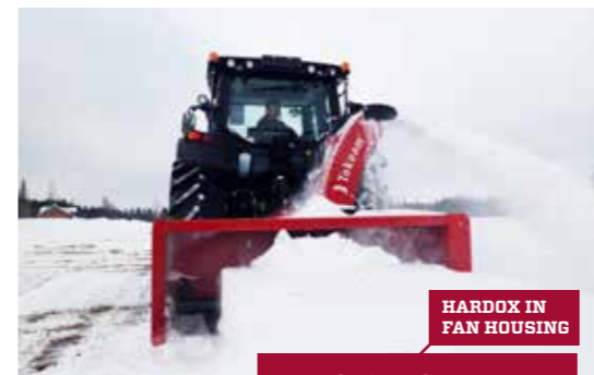
HARDOX IN FAN HOUSING 241 THS FLEX

SPESIFICATIONS ON PAGE 12. / FOR MORE INFORMATION GO TO TOKVAM.NO/EN