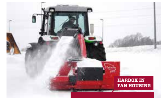
HARDOX IN FAN HOUSING 240 THS / 220 THS Proff

The versatile version of the 240 THS. The 241 THS Flex is available for rear mount pull, rear mount push and front mount as standard. It also has many of the fully tested solutions we know and love from the 240 THS. If you need a flexible and functional medium-sized snow blower which provides the well-known Tokvam quality, then pick the 241 THS.